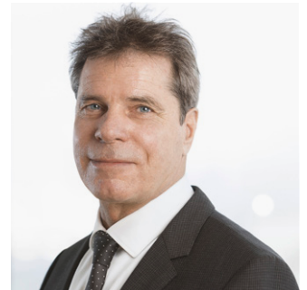
By Dieter Berg IUMI President

Global trade has been growing for decades – but, owing in no small part to faltering economic activity, we saw a significant decrease in 2015 which is likely to be replicated in 2016. Any hope of a quick recovery is doubtful due to a strong increase in protectionist trends in western countries – such as US President Trump's threat to introduce import tariffs. If trading partners were to hit back, the impact on global trade and economies worldwide would be significant. And such difficulties are likely to impact the international marine insurance industry where market volumes have been declining steadily in recent years.